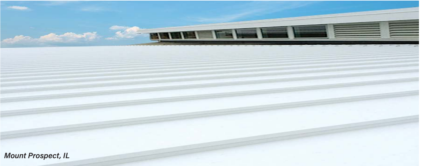
Mount Prospect, IL